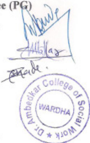
Principal PRINCIPAL I/c. Dr. Ambedkar College of Social Work, Wardha